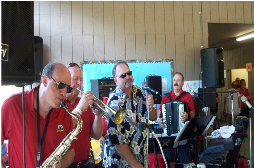
A good time was had by all at the 2015 PACC Annual Family Picnic. Music was provided by the "Eddie Forman Orchestra" from Massachusetts.